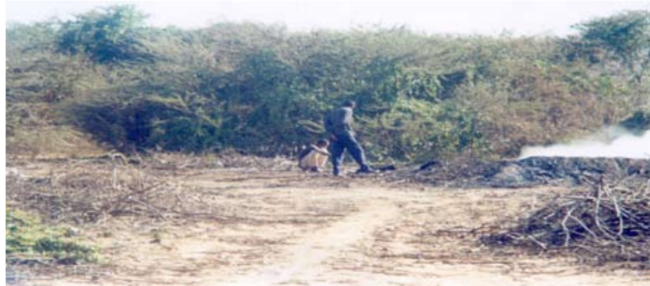
Photo. 2: Small scale charcoal production from mesquite at Biyo-xidheenka

According to interviewees, mesquite firewood burns steadily even with freshly cut branches, giving off intense heat with little smoke. Charcoal prepared from mesquite is gaining momentum and popularity in most of areas visited. The team saw charcoal produced from mesquite wood for domestic use but the practice is very limited in scale compared to that of firewood.