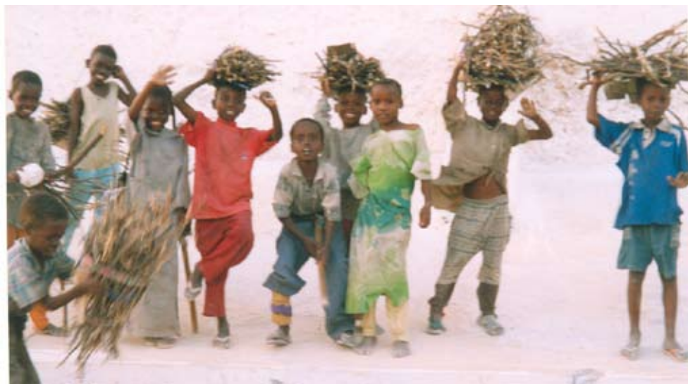
Photo. 3: Children in Merkka, Southern Somalia, carrying mesquite firewood(2005)

The viability and effectiveness of mesquite firewood is vividly demonstrated in the Merkka town in Southern Somalia, where it is sold side by side with charcoal. It is estimated that at least 40% of the population of this major coastal town use mesquite firewood for cooking. Likewise, the town's Arabian style buildings are whitewashed with lime prepared with mesquite wood.